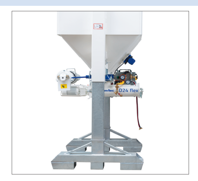
^ The m-tec®D24 flex is particularly easy to transport thanks to its compact dimensions of 1200x1200 mm. The mixing tube and mixing shaft can be attached directly to the motor for transport.