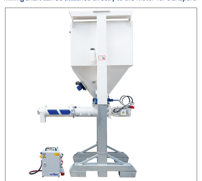
^ The control cabinet of the m-tec® D24 flex is flexible and easy to remove.