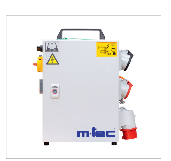
^ The control cabinet of the m-tec® D24 flex can be equipped with various options.